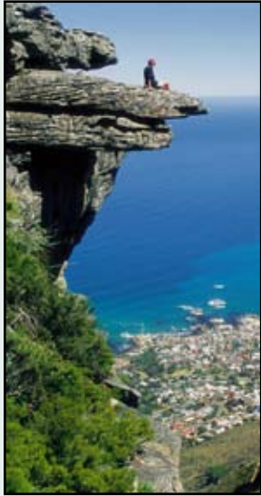
TABLE MOUNTAIN, CITY & ROBBEN ISLAND

In the morning, transfer with your private guide to the Robben Island ferry terminal and depart for your tour of this historically significant symbol of South Africa's triumph over apartheid. Visit the prison block and a drive around the island with views of the city across the bay. Next, return to the city and embark on a cable car ride to the top of iconic Table Mountain. You are afforded a birds-eye view of both city and peninsula from the 3400-foot summit of this spectacular landmark, where you can learn about the unique flora and fauna of the Cape. Next, pass through the scenic Cape Malay Quarter and stroll through the Company Gardens, before browsing vendors' stalls at Greenmarket Square. With your private guide, you are escorted to the Castle, the oldest building in South Africa. Finally, visit the moving District Six Museum for a unique insight into the lives of residents, who were forcibly removed from their homes during the height of the Apartheid Era.